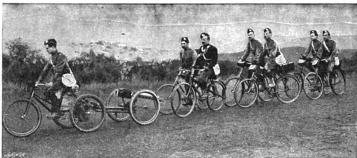
A motor cycle, with Maxim gun attached. Cyclists in rear carrying ammunition.

war, were brought in, giving details of the number of cattle seen, and of the farms, butchers' and grocers' shops that might be called upon to yield supplies.