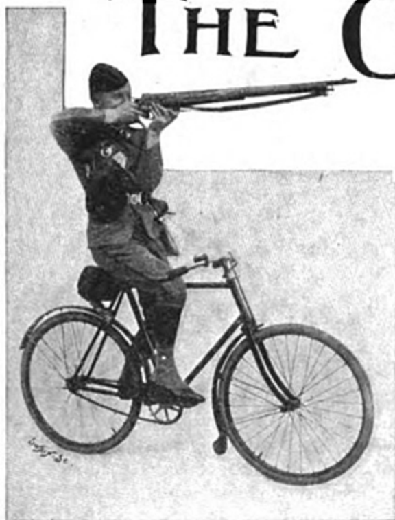
Shooting while riding.

THE bicycle has now won for itself a recognised place in the armies of the world; it is proving of great value in the South African campaign.