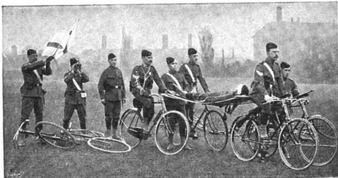
Cycling ambulance corps at work.

True, the horse-soldier is superior in strength to the cyclist. He can go where no cyclist can follow awheel. The cyclist has no shock of action , to use a military phrase, and a thorn on his path may put him out of play. But these drawbacks will not withhold the soldier cyclist from occupying a most important part in an army's organisation. And the chances of a bicycle being damaged in action are smaller than in the case of a horse.