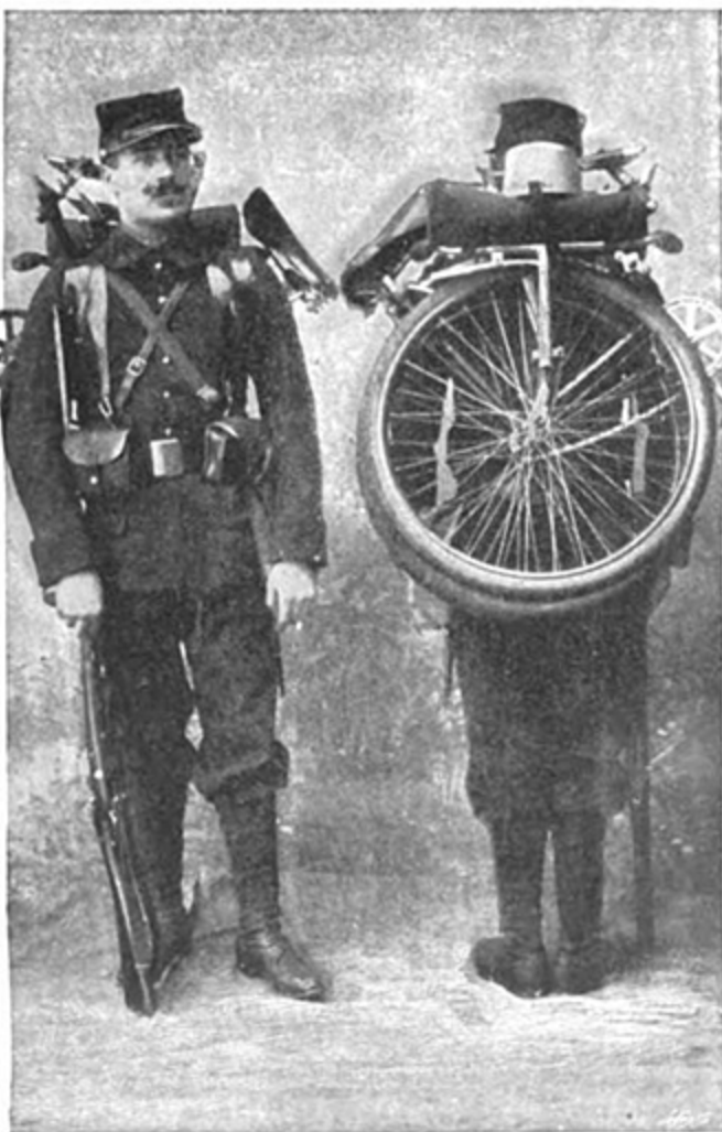
Folding cycle, invented by Major Gérard, of the French Army.

A special bicycle has been designed for wire-laying. The wires are carried on a reel, which is operated from the front wheel. This reel contains about a third of a mile of wire, and the rider can proceed at full speed and drop the wire upon the road behind him. It can be wound up again in the same way. The rider carries behind the saddle the necessary tele-