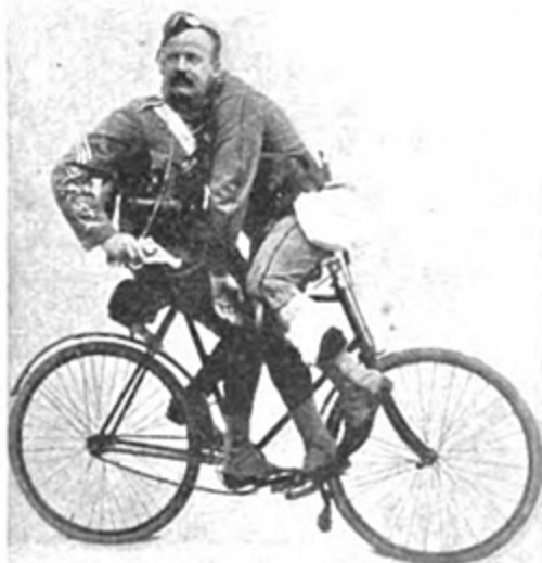
— lift him on to the handle-bars, and take him safely out of danger.