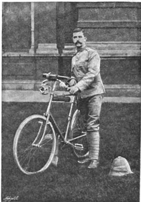
One of the bicycles recently dispatched to South Africa by the British War Office.

Being volunteers, they cannot, of course,—unless special Acts of Parliament are passed—take an official part in the South African War. However, cyclists are already bearing