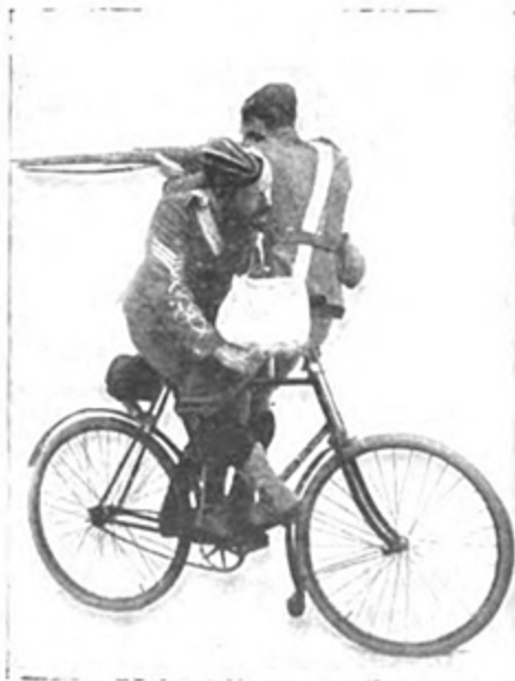
A soldier, who has lost his cycle, riding on the handle-bars of his comrade's machine, and covering the retreat.